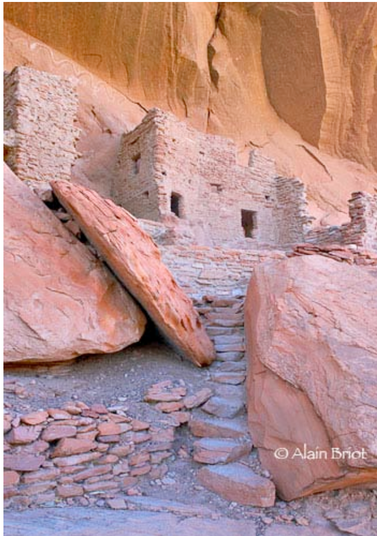
Cliff Dwellings 2

During 2006 my work focused upon color, tonality control and printing. This work culminated in the publication of my new "Printing Mastery Workshop on DVD" which took me a full year to create. The contents of the DVD are similar to those of my Expressive Print seminar, except you do not need to travel and you can watch the presentations as many times as you like in the comfort of your home or studio. In 2007 I am working on several new projects which at this time I am keeping private.