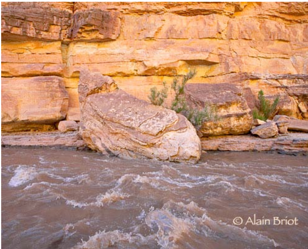
Along the River 6